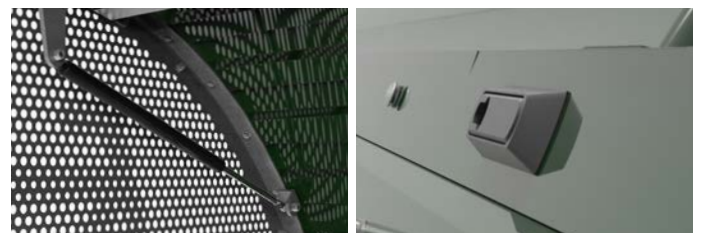
Gas sprung door