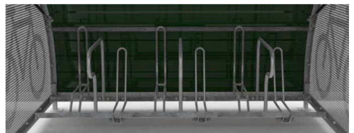
Space for 6 bikes with locking bar