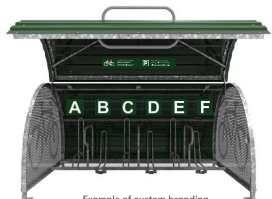
Example of custom branding