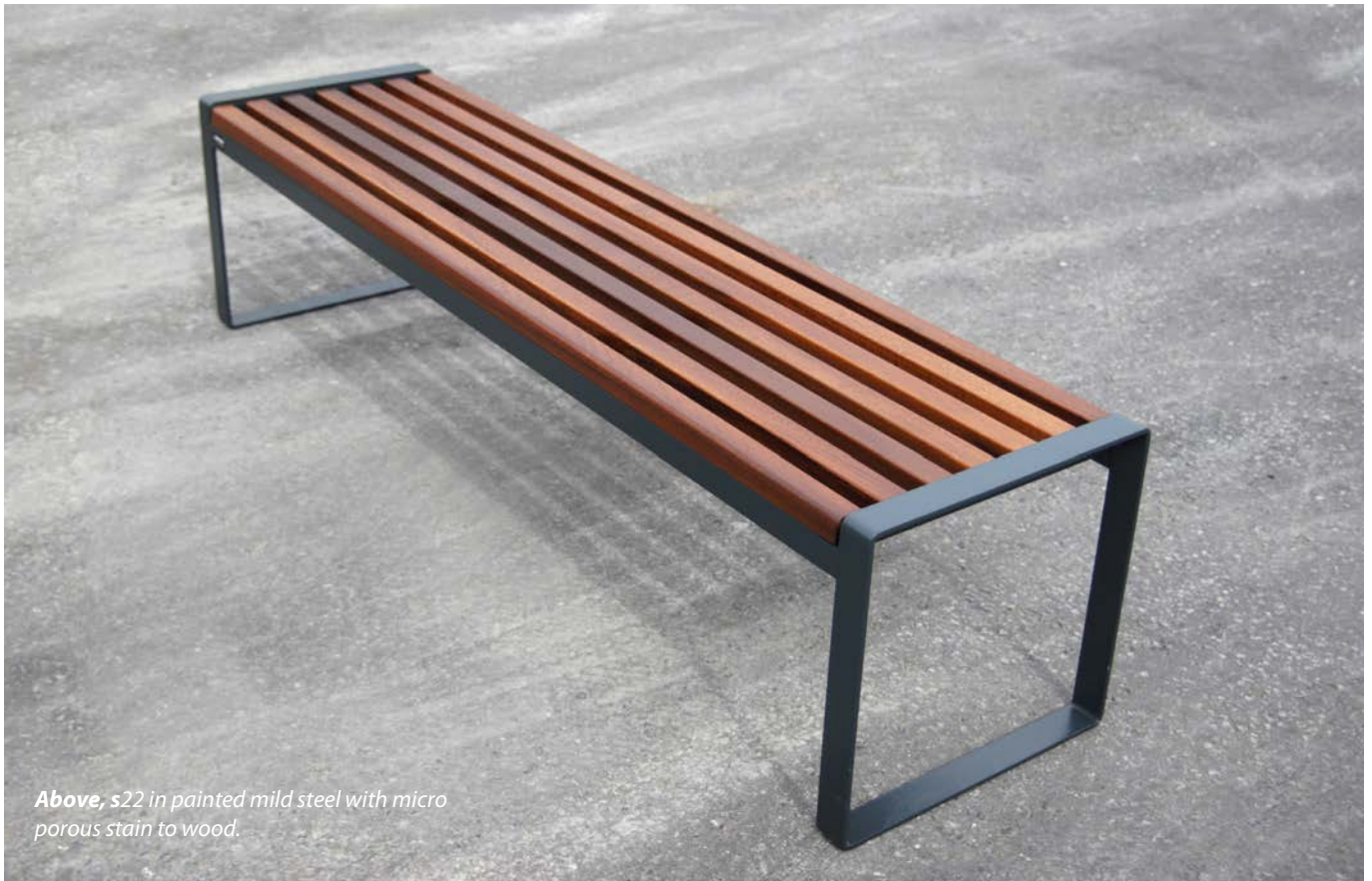
Above, s22 in painted mild steel with micro porous stain to wood.