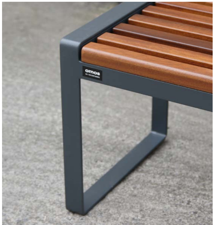
Above right, s22 bench detail.

If the timber is left untreated, over time it will gradually change to a silvery grey colour. The timber will remain structurally sound without further maintenance.