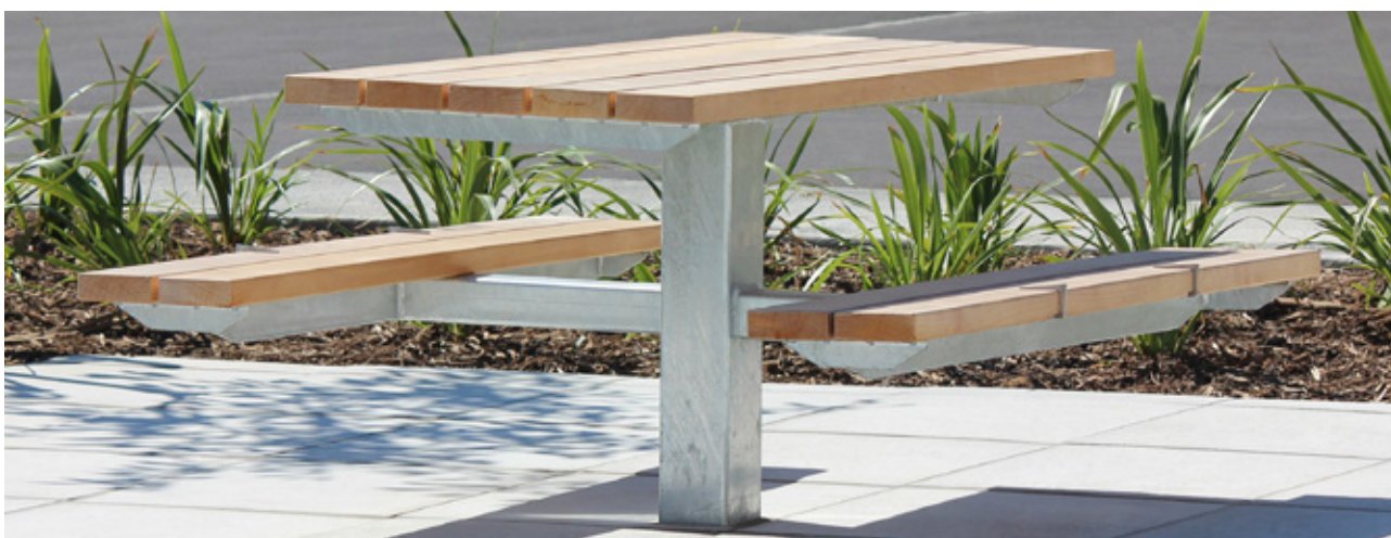
Plaza Picnic Setting