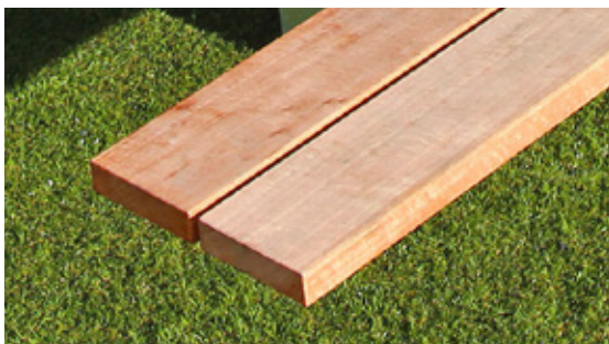
Plaza Picnic Setting seat close-up detail

Dirt can be removed using mild detergents. If the timber is left untreated, over time it will gradually change to a silvery grey colour. The timber will remain structurally sound without further maintenance.