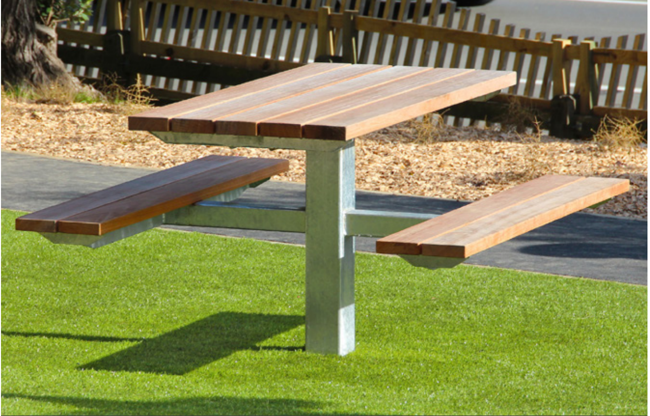
Plaza Picnic Setting, below ground fixing with Hardwood Battens