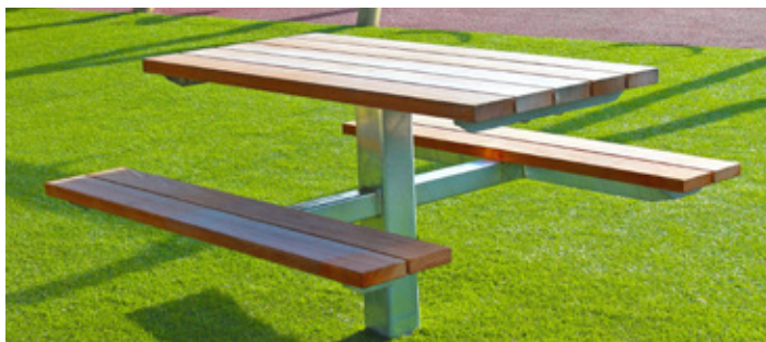
Plaza Picnic Setting, side view