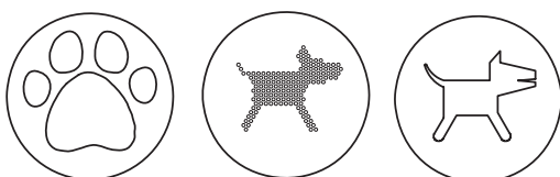
Custom Logo Options.

We can punch or laser cut your custom logo or design