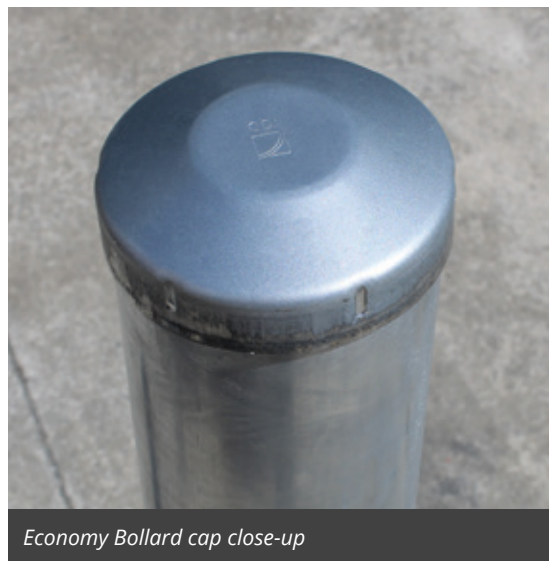
Economy Bollard cap close-up