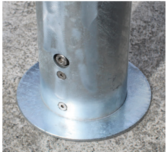
Economy Bollard Removable Type A