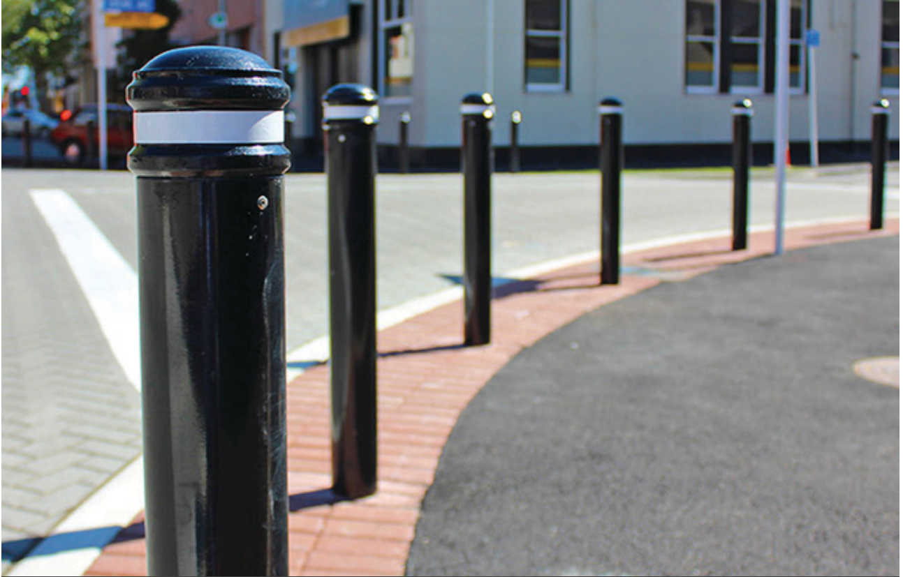
Motif Bollard with B2 Head and optional reflective strip